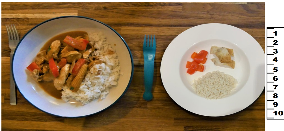
10 inch plate

If your child hasn't eaten their meal, try not to give in if they ask for less healthy options. You can offer one of their "safe" foods with meal and they can fill up on this. Otherwise, let them know that if they do not want to eat this meal, there will be something else later.