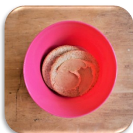
Oatcakes and hummus