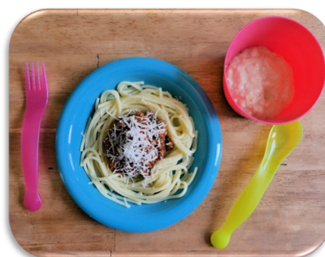
Spaghetti bolognese, rice pudding