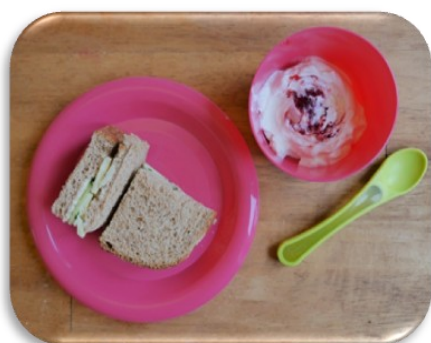
Wholemeal bread sandwich with tuna & cucumber, yogurt & fruit puree