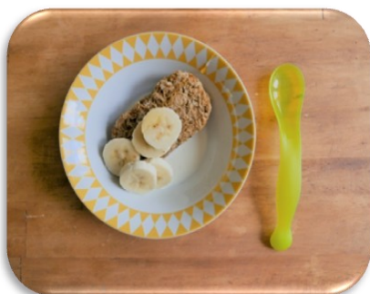
Wheat biscuit with full fat milk & banana